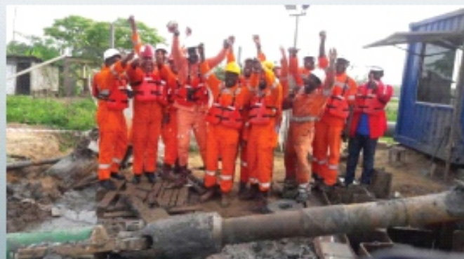
Jubilant at the HDD string exit point at the NGC HDD site

The 42-kilometre-long pipeline, of various sizes ranging from 2 to 12 inch, passes through swampy terrain and dry land including a major river crossing. The pipeline will collect about 30 million cubic feet a day of processed associated gas from the Otumara and Saghara fields in the western Niger Delta and send it through the Escravos-Lagos system to the domestic market, helping to reduce flaring, or the burning of gas produced alongside oil.