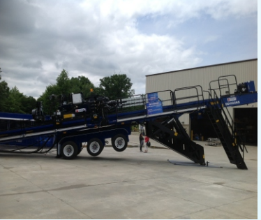
AMERICAN AUGER DD1100 RIG (500ton Pullback Capacity) & MUD CLEANING & RECYCLING UNIT (MCR-10000) - YEAR OF PURCHASE 2012