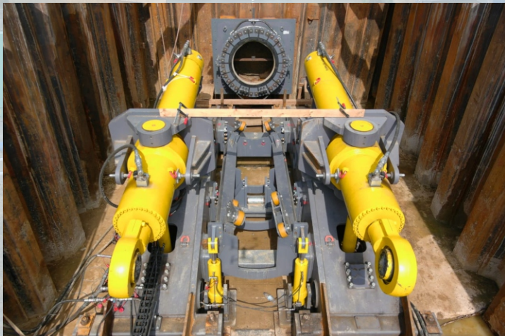
PIPE JACKING UNIT AND ACCESSORIES (800ton Push Force) YEAR OF PURCHASE 2022