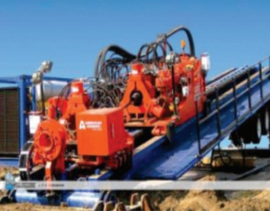
AMERICAN AUGER DD1100 RIG (500ton Pullback Capacity) & MUD CLEANING & RECYCLING UNIT (MCR-10000) - YEAR OF PURCHASE 2012