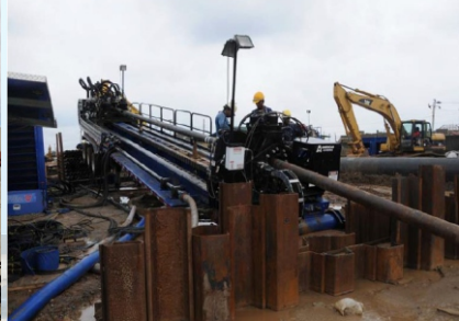
AMERICAN AUGER DD1100 RIG (500ton Pullback Capacity) & MUD CLEANING UNIT - YEAR OF PURCHASE 2013