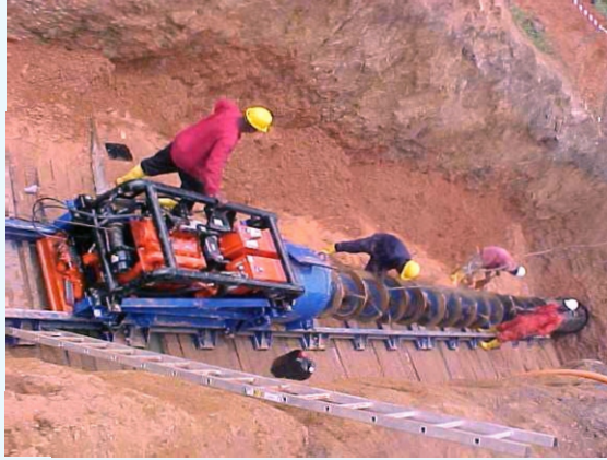
AMERICAN AUGER 24 - 100 HORIZONTAL EARTH BORING MACHINE - YEAR OF PURCHASE 2000