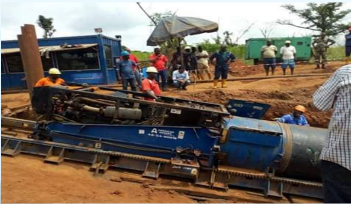
AMERICAN AUGER 48/54 - G900 HORIZONTAL EARTH BORING MACHINE - YEAR OF PURCHASE 2010