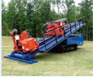
AMERICAN AUGER DD440T RIG (200ton Pullback Capacity) & MUD PROCESSING & RECYCLING UNIT (MPR-6000) - YEAR OF PURCHASE 2008