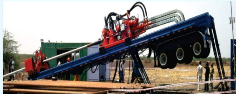
AMERICAN AUGER DD625 RIG (300ton Pullback Capacity) & MUD CLEANING SYSTEM - YEAR OF PURCHASE 2012