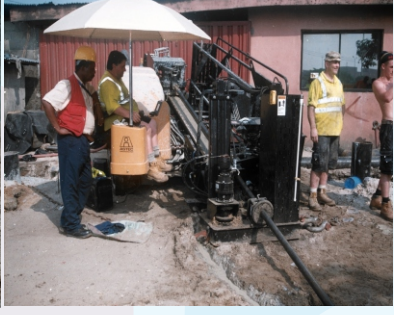
ASTECC 3292 RIG (15ton Pullback Capacity) & MUD CLEANING SYSTEM - YEAR OF PURCHASE 2008