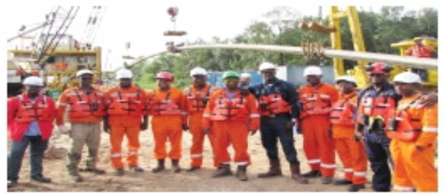
HDD Site during the pullback operation.

The operation itself was unique, highly fragile and must not fail. After performing an accurate geotechnical survey, ENIKKOM and SCNL executed the job by using the "intercept methodology". SCNL prepared at the two extremes of the crossing two working areas meant to accommodate ENIKKOM's rigs of 300 tons and 500 tons which drilled simultaneously to connect the two ends.