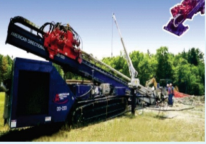
AMERICAN AUGER DD220 RIG (100ton Pullback Capacity) & MUD CLEANING UNIT - YEAR OF PURCHASE 2012