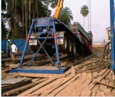
AMERICAN AUGER DD580 RIG (300ton Pullback Capacity) & MUD CLEANING SYSTEM - YEAR OF PURCHASE 2003