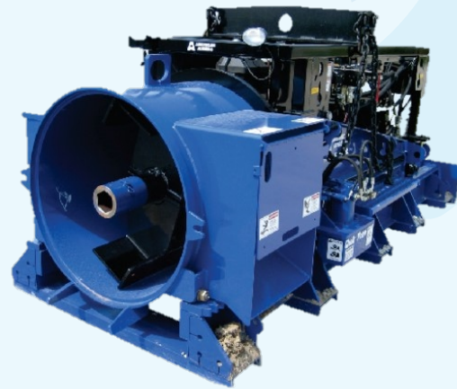
AMERICAN AUGER 42/48 - 600 HORIZONTAL EARTH BORING MACHINE - YEAR OF PURCHASE 2010