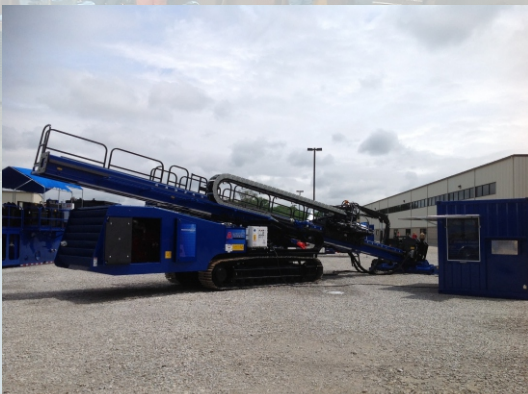
AMERICAN AUGER DD155 RIG (70ton Pullback Capacity) & MUD CLEANING UNIT - YEAR OF PURCHASE 2017