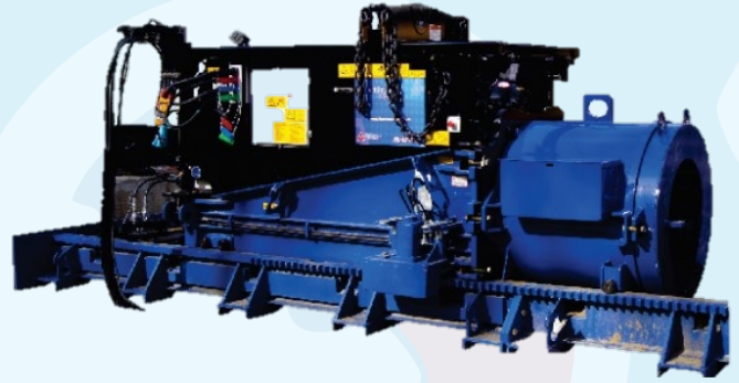
AMERICAN AUGER 36 - 340 HORIZONTAL EARTH BORING MACHINE - YEAR OF PURCHASE 2010